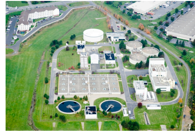
Lehigh County Authority Facility, commissioned in 1990, is dedicated to providing high quality, affordable wastewater services while protecting the environment.

For more information about our services, call us at 610-395-9782 or visit our website at www.lehighcountyauthority.org .